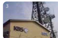
1. Perimeter Surveillance System for the President Office, 2. Royal Tombs of the Joseon Dynasty-UNESCO World Heritage with total integrated surveillance system (include CCTV) 3. KBS Digital TV Relay Station