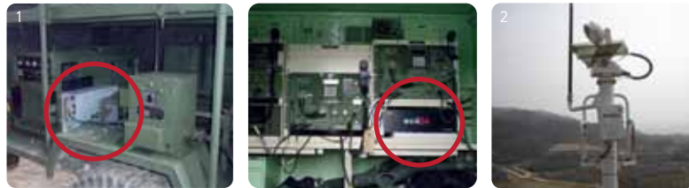
1. Mobile Tactical Operation Vehicle, Mobile generator 2. CCTV, Thermal Image Camera, Surveillance system at coastal, border line

GROUND has implemented lightning protection system for entire NAVY bases from year 2001 until now (2013. 5), and has supported for 365/24 operation without interruption by lightning, and also protection for Perimeter Surveillance System of the President Office, Special agencies, command and control system, communication vehicles of army, navy, air forces are under implementation continuously with eca3G (3G digital lightning protection device) and PGS grounding system.